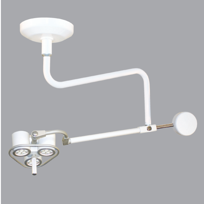
Dimensions and range of movement