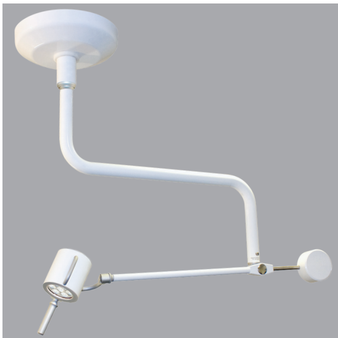
Dimensions and range of movement